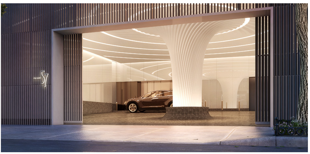
PRIVATE PORTE-COCHÈRE AND AUTOMATED PARKING GARAGE