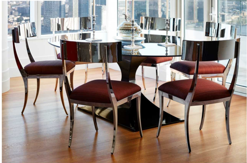
Panoramic skyline views are best enjoyed in bed, in the bathtub or at the dinner table.